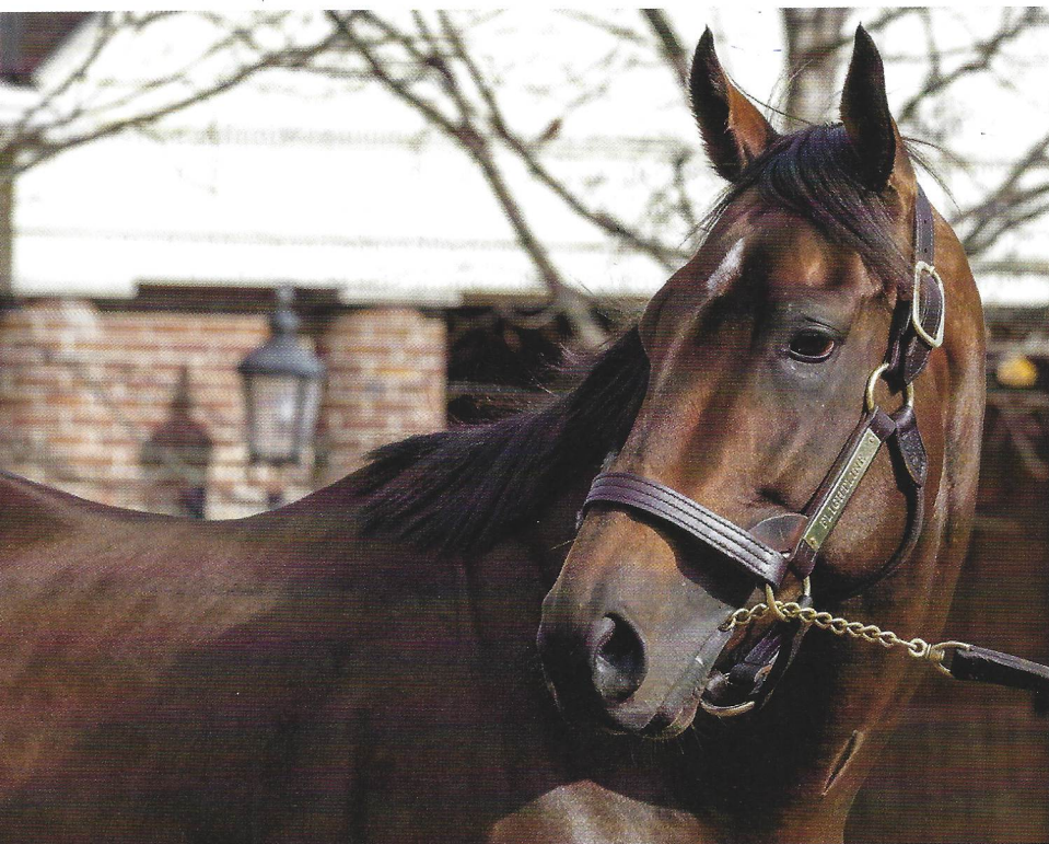
Flightline at Lane's End Farm, 11 days after winning the Classic